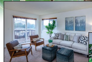
Upper Level Main Living

Make life simple with this lovely home that consists of 3 bedroom, 1.5 baths and attached 2-car garage. One of the bedrooms on the lower level has its own entrance to a side yard. Step saver kitchen with dishwasher, refrigerator and stove has adjacent dining area with slider to rear deck balcony offering views towards downtown. Upper level has access to the garage from the laundry area near the kitchen. A spiral staircase takes you down stairs to the lower level bedrooms and a bathroom. Outdoors you'll find easy maintenance with a sitting area along a path. Enjoy a location close to popular downtown Morro Bay and its Harbor area, the beach, freeway access, proximity to the high school and more. Easy distance to San Luis Obispo or north to nearby Cayucos and onto Cambria.