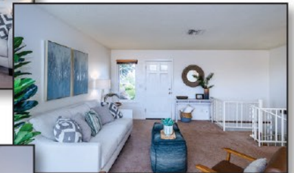
3 Bd, 1.5 Bath - Upper Main Living Area View Balcony -- Attached 2-Car Garage Bedroom With Its Own Entrance