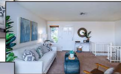
3 Bd, 1.5 Bath - Upper Main Living Area View Balcony -- Attached 2-Car Garage Bedroom With Its Own Entrance