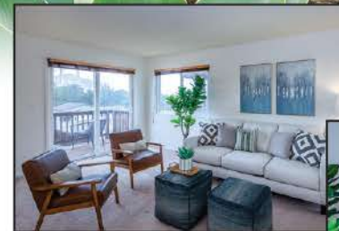
Upper Level Main Living

Make life simple with this lovely home that consists of 3 bedroom, 1.5 baths and attached 2-car garage. One of the bedrooms on the lower level has its own entrance to a side yard. Step saver kitchen with dishwasher, refrigerator and stove has adjacent dining area with slider to rear deck balcony offering views towards downtown. Upper level has access to the garage from the laundry area near the kitchen. A spiral staircase takes you down stairs to the lower level bedrooms and a bathroom. Outdoors you'll find easy maintenance with a sitting area along a path. Enjoy a location close to popular downtown Morro Bay and its Harbor area, the beach, freeway access, proximity to the high school and more. Easy distance to San Luis Obispo or north to nearby Cayucos and onto Cambria.